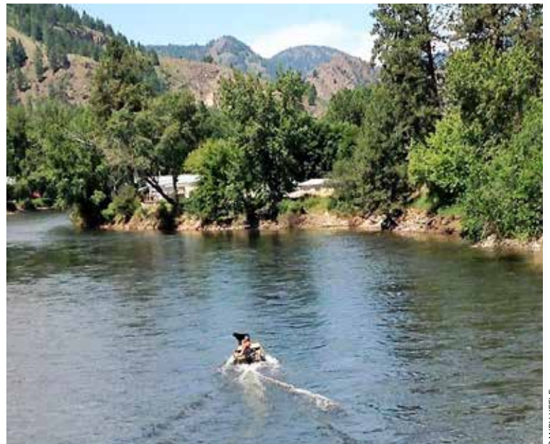
Tubing & small outboard motorboats on the Kettle River near Grand Forks in Boundary Country.