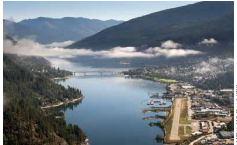
Aerial view of Nelson on the West Arm of Kootenay Lake in the Selkirk Mountains.